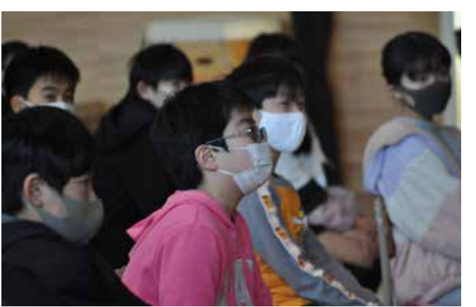
Children are completely caught up in the story of lecturer.